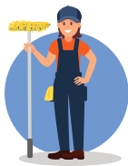
Micro-fiber Mop System