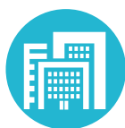
Building Service Cleaners