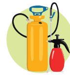
Any Coarse Trigger Sprayer