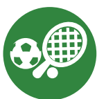
Sports and More