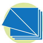
Make Your Own Wipes