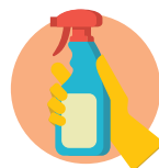
Any Handheld Trigger Sprayer Bottle