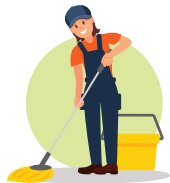
Standard Mop Bucket