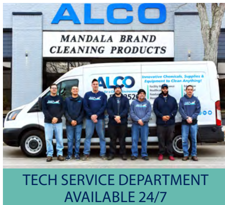
TECH SERVICE DEPARTMENT AVAILABLE 24/7