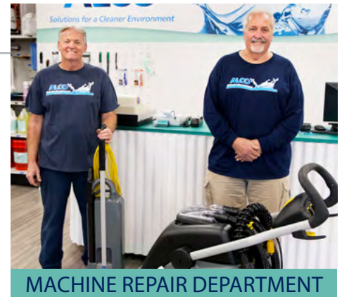
MACHINE REPAIR DEPARTMENT